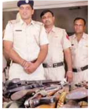
सिरसा सदर थाना में रखा असलाह।

सिरसा। डेरा सच्चा सौदा प्रमुख के जेल चले जाने के बाद जिला प्रशासन द्वारा जिलाभर के असलाहधारकों को असलाह जमा करवाने के लिए आदेशों के बावजूद डेरा प्रबंधक मंडल ने मात्र 33 असलाह की जमा करवाया है जबकि डेरा के पास सदर पुलिस थाना सिरसा रिकॉर्ड में 67 हथियार माने जा रहे हैं। प्रशासन की ओर से डेरा के 10 असलाह लाइसेंस रद्द भी किए जा चुके हैं।