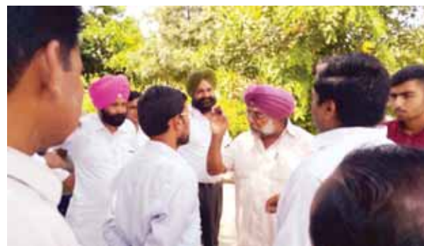
सिरसा के अतिरिक्त उपायुक्त से मिलने पहुंचे डेरा शिक्षण संस्थान में पढ़ रहे बच्चों के अभिभावक।