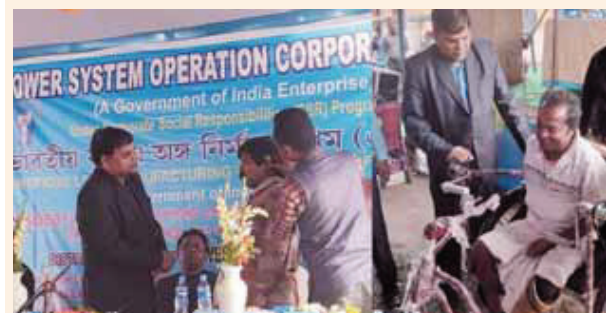
Eastern Regional Load Despatch Centre (ERLDC) of Power System Operation Corporation Limited (POSOCO) in association with ALIMCO organised a camp for differently-abled persons. 268 appliances like Hearing aids, Wheel Chairs, Tricycle, Elbow Crutches etc. worth ₹15 Lakhs were distributed to 219 beneficiaries under CSR programme at Balurghat, District South Dinajpur in West Bengal recently