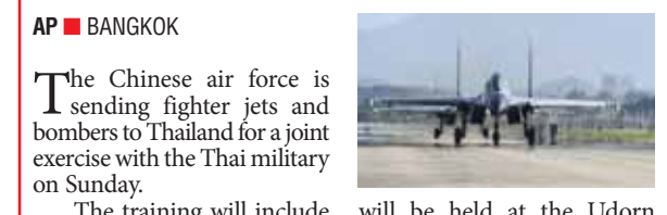
■ BANGKOK

The Chinese air force is sending fighter jets and bombers to Thailand for a joint exercise with the Thai military on Sunday. The training will include air support, strikes on ground targets and small and large-scale troop deployment, the Chinese Defense Ministry said in a statement posted on its website. China's expanding military activities in the Asia-Pacific region have alarmed the United States and its allies and form part of a growing competition between the world's two largest economies. US Defence Secretary Lloyd Austin visited Thailand in June as part of an effort to strengthen what he called America's "unparalleled network of alliances and partnerships" in the region. The Falcon Strike exercise will be held at the Udorn Royal Thai Air Force Base in northern Thailand near the border with Laos. Thai fighter jets and airborne early warning aircraft from both countries will also take part. The training comes as the U.S. holds combat drills in Indonesia with Indonesia, Australia, Japan and Singapore in the largest iteration of the Super Garuda Shield exercises since they began in 2009. It also follows China's sending warships, missiles and aircraft into the waters and air around Taiwan in a threatening response to a visit by U.S. House Speaker Nancy Pelosi to the self-ruled island, which China claims as its territory.