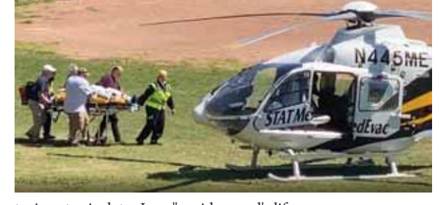
■ NEW YORK