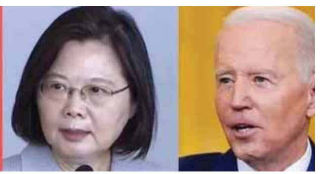
PTI ■ WASHINGTON

China's actions to "intimidate and coerce" Taiwan following US House Speaker Nancy Pelosi's visit to Taipei are fundamentally at odds with the goal of peace and stability, the White House said, asserting that the US would take "calm and resolute" steps to support the self-ruled island. China's ruling Communist party has long claimed sovereignty over Taiwan. Beijing insists its "one-China principle" would bar most incumbent foreign government officials from setting foot on the island. The People's Liberation Army announced war games in