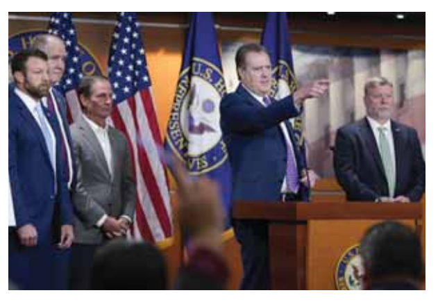
AP ■ WASHINGTON

Republicans in Congress who are relying on Donald Trump to excite voters in the fall elections are not only defending the former president against the FBI search of his Mar-a-Lago home but politically capitalising on it with grave and potentially dangerous rhetoric against the nation's justice system. The party that once stood staunchly for law-and-order has dramatically reversed