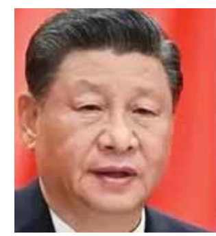
PTI ■ WASHINGTON

China's actions to "intimidate and coerce" Taiwan following US House Speaker Nancy Pelosi's visit to Taipei are fundamentally at odds with the goal of peace and stability, the White House said, asserting that the US would take "calm and resolute" steps to support the self-ruled island. China's ruling Communist party has long claimed sovereignty over Taiwan. Beijing insists its "one-China principle" would bar most incumbent foreign government officials from setting foot on the island. The People's Liberation Army announced war games in