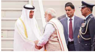
Prime Minister Narendra Modi shakes Abu Dhabi's Crown Prince Sheikh Mohamed bin Zayed Al Nahyan at New Delhi airport on Tuesday. The Crown Prince will be India's chief guest at Republic Day celebrations.

Crown Prince of Abu Dhabi Sheikh Mohamed bin Zayed Al Nahyan arrived here on Tuesday to a warm hug from Prime Minister Narendra Modi who received him at the airport.